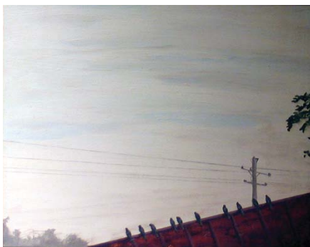
Melba Price, 2005