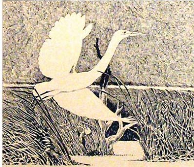
Bob Crump, 2005

FEATURING WORK BY 100 ARTISTS IN ALL MEDIA